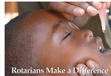
Rotarians Make a Difference

Rotary builds peace through its single largest and most significant project: PolioPlus. To date, Rotarians worldwide have contributed more than $1 billion toward the eradication of polio. Polio once infected more than 350,000 children annually. In 2011, only 650 cases were reported, and in 2012 only 223.